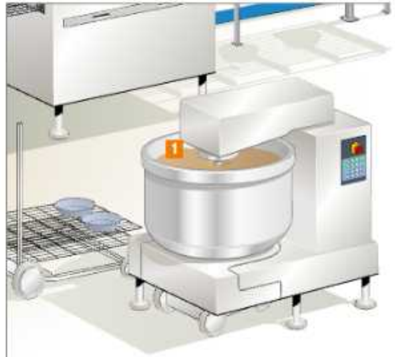
1 Hygienic Design Zone (product zone)